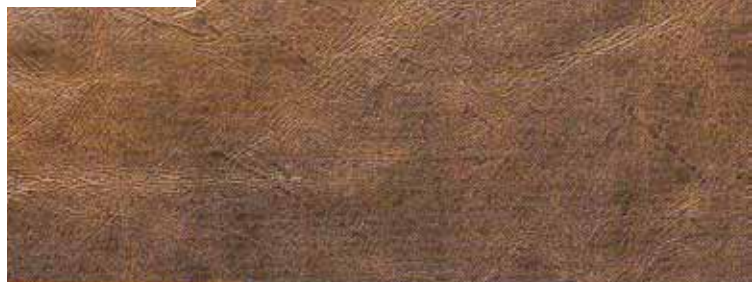
Loose Belly Hide